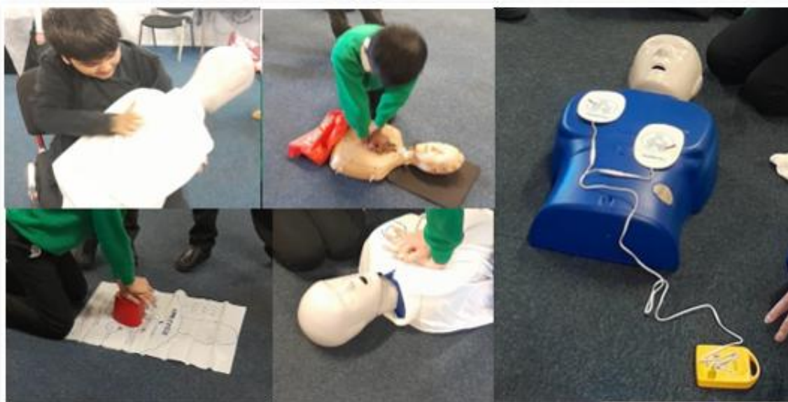
The group had the pleasure of meeting Manny and Annie – our CPR mannequins.

Who knows, we could be looking at future medics or some very believable acting skills for TV!