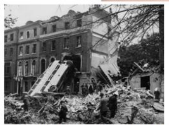
Germany tried to force Britain to surrender during 'the Blitz' (September 1940 – May 1941) by bombing its major cities.

Ration books were used to allocate weekly allowances of food per person and per family.