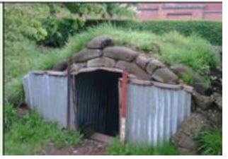
During air raids, people hid in underground Anderson shelters made of corrugated iron.