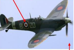
The Spitfire could fly at speeds of up to 362 mph.