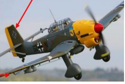
Nazi swastika symbol