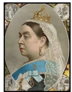
Queen Victoria Reign 1837 - 1901