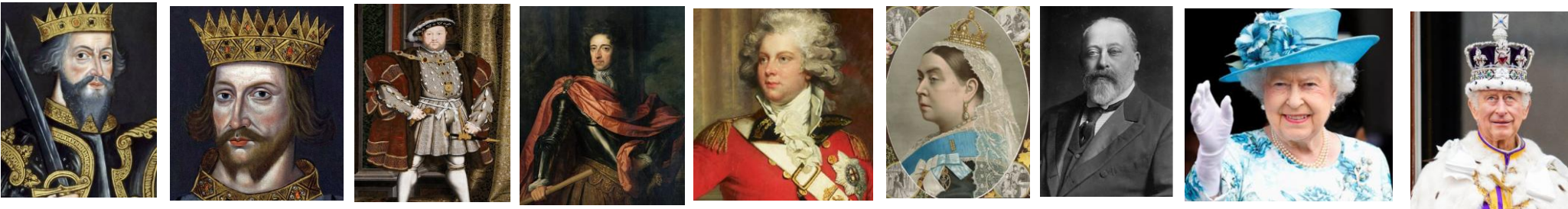
Monarchs (Kings and Queens)